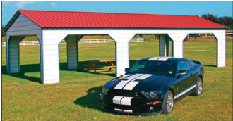
3 STALL CARPORT