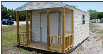
UTILITY WITH PORCH