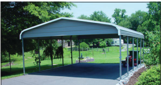
CARPORT & GABLE