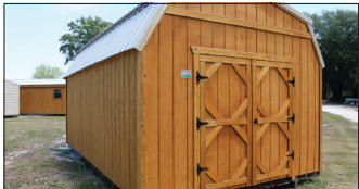
WOOD WITH END BARN DOORS