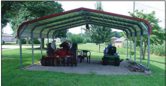
ROUNDED STYLE CARPORT