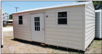
SIDE DOOR PORTABLE