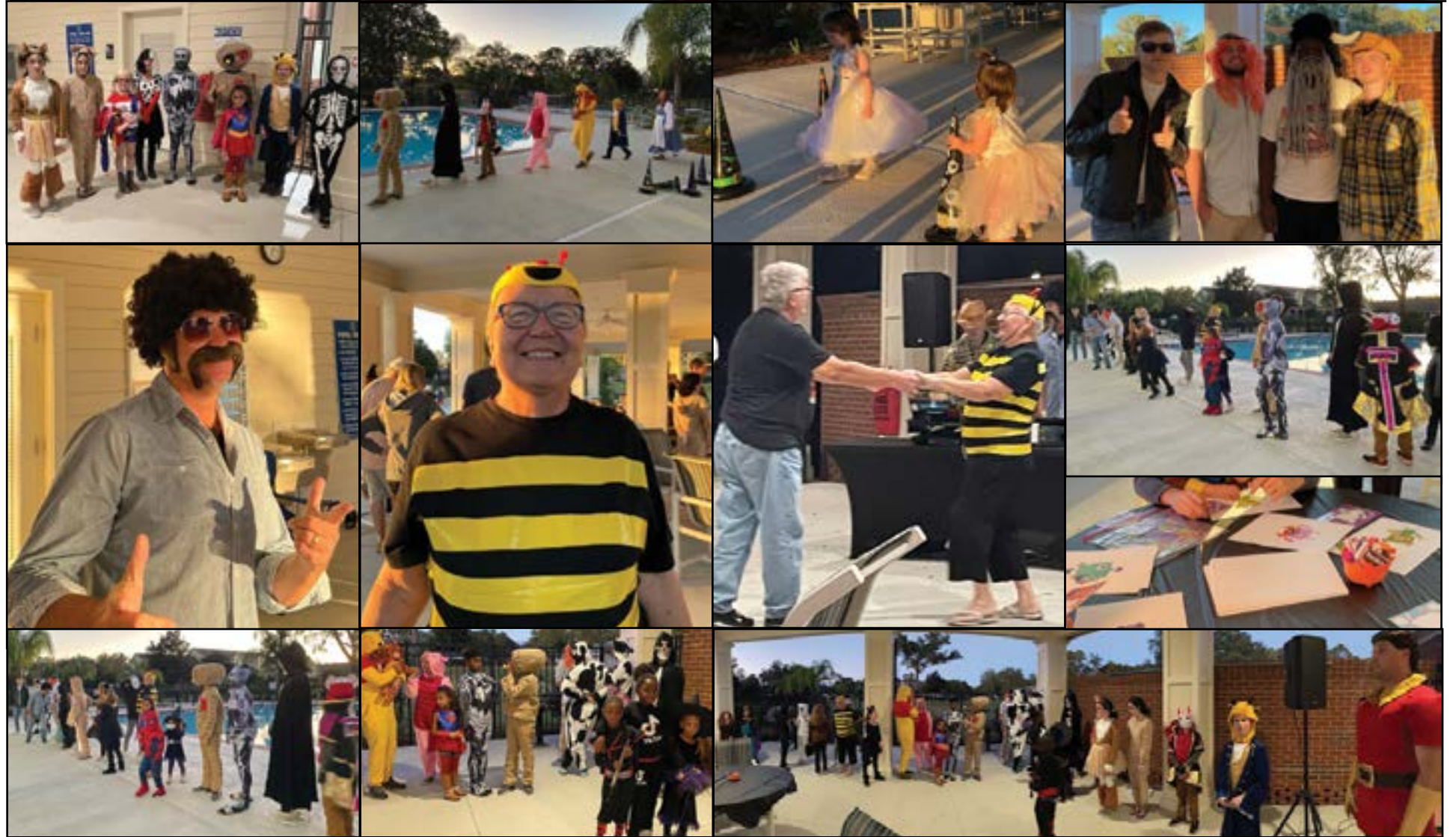
THESE WERE SPOTTED AT THE HALLOWEEN COSTUME PARTY AT THE POOL CABANA ON OCT 30, 2021

NOVEMBER 2021 HAPPY THANKSGIVING VOLUME 2 • ISSUE 11