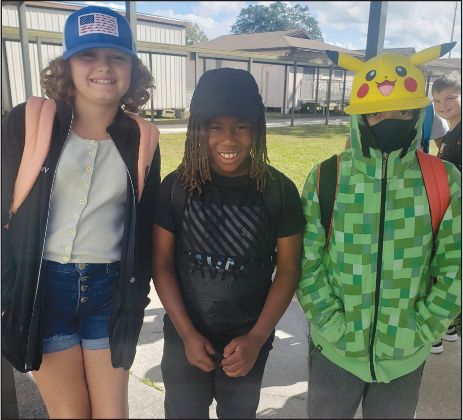
Lakeside Elementary celebrated Red Ribbon Week with a crazy hat day on Wednesday, Oct. 26.